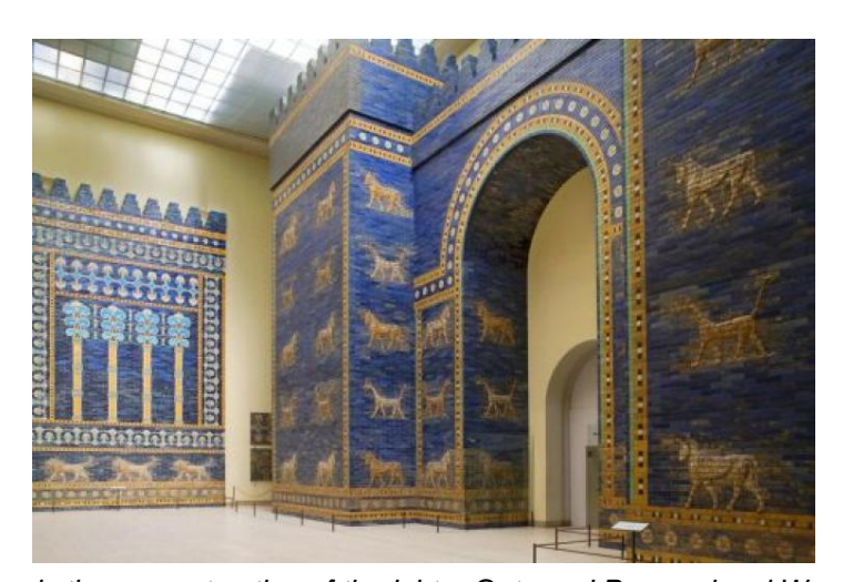
Above is the reconstruction of the Ishtar Gate and Processional Way at the Pergamon Museum, Berlin. It was reconstructed from material excavated by Robert Koldewey and completed in the 1930s

This occurred in 522-21BC when it revolted and was later captured for Darius by general Zopyrus (see Herodotus 3. 151-159). One of the walls was destroyed and its 100 gates dismantled during this siege that lasted around 2 years.