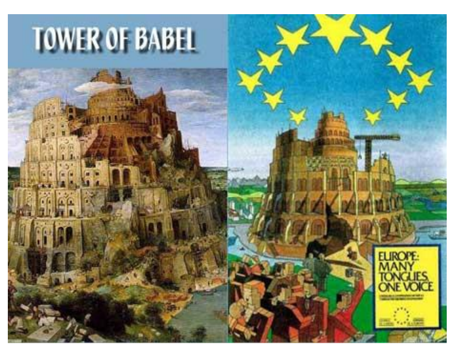
EU poster (left) compared to an artist's depiction of the tower of Babel (right)

(extracted from A Note on the Three Woes and Babylon/Tyre Parallels by C White)