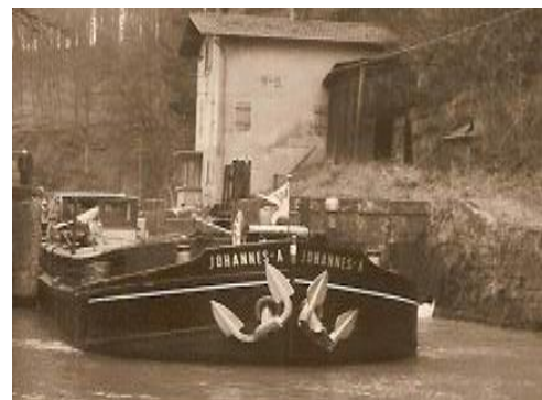
Johannes-A – my parents inland navigation boat in France (1968)

The travelling of the Dutch is also apparent in the inland navigation of Europe. More than half of the 13.000 vessels are Dutch. The rest are registered in Belgium, France and Germany.