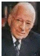
Herbert W Armstrong 1892 - 1986

To fully understand the significance of these prophecies, you need to know where the United States and Britain are mentioned in prophecy. This question is answered in the booklet "The United States and the British Commonwealth in Prophecy."