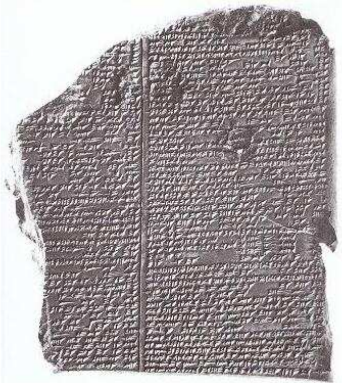
A fragment of a tablet showing the story of the flood, inscribed in Assyrian cuneiform characters.

□ Then was the launching full of difficulty; there was shifting of ballast above and below till two thirds was submerged. I loaded into her all that I had of gold and of living things, my family, my kin, the beast of the field both wild and tame, and all the craftsmen. I sent them on board, for the time that Shamash had ordained was already fulfilled when he said, "in the evening, when the rider of the storm sends down the destroying rain, enter the boat and batten her down." The time was fulfilled, the evening came, the rider of the storm sent down the rain. I looked out at the weather and it was terrible, so I too boarded the boat and battened her down. All was now complete, the battening and the caulking; so I handed the tiller to Puzur-Amurri the steersman, with the navigation and the care of the whole boat.