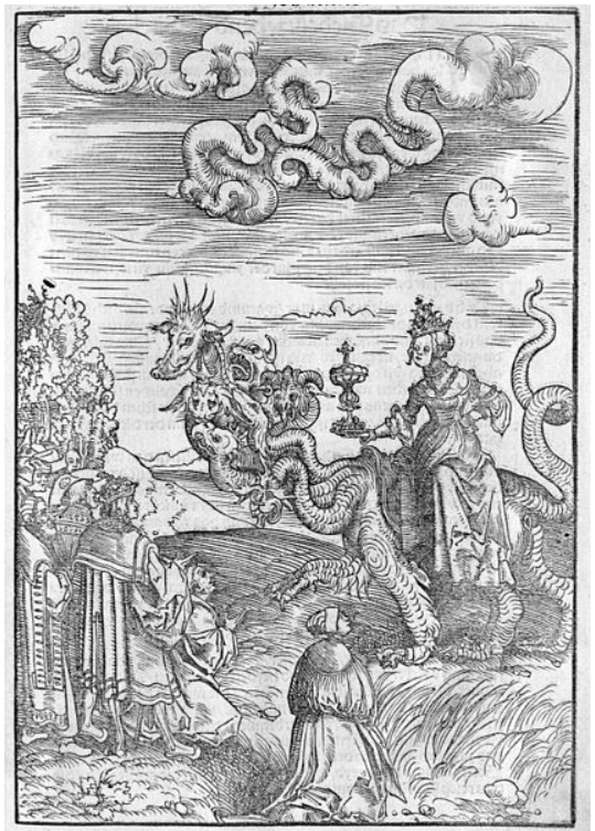
Whore of Babylon wearing a papal tiara from a woodcut in Luther's translation of the New Testament

This beast therefore is a symbol of the Roman Empire following the apostolic days, and down through this period to the end, when the beast and the rider go into perdition ( verses 8 and 16 ).