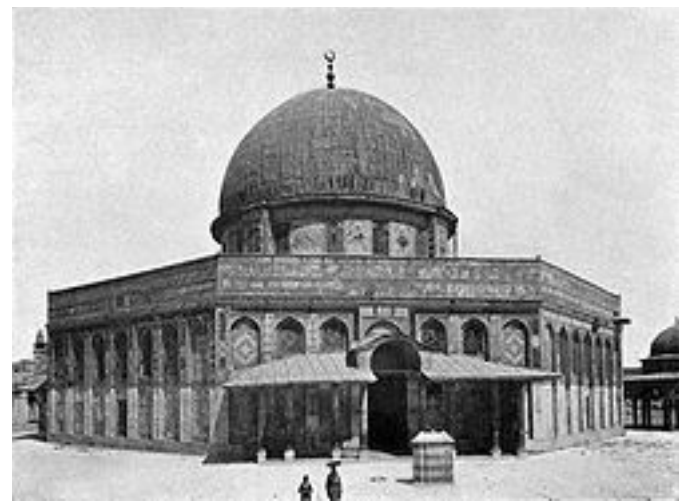
Muslim shrine, Dome of the Rock, on the Temple Mount in Jerusalem

worship on the very spot where both of the temples stood, one being the Temple of Solomon.