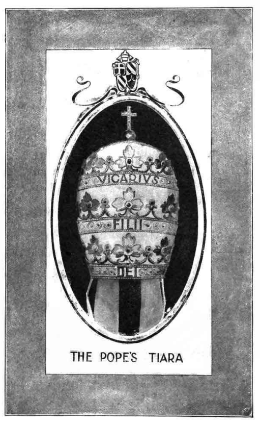
PROM A PHOTOGRAPH TAKEN IN THE VATICAN MUSEUM

As we add these sums together from each of the three words it makes exactly 666, which further establishes the "Roman Empire" as the beast, and also of this man.