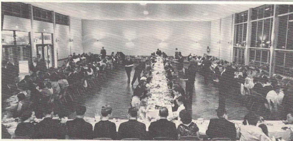
Night Much to be Observed, Sydney