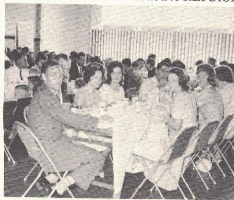
Brisbane Brethren enjoying Festival

Festival — Continued on Page 5 and their families returned to REJOICE