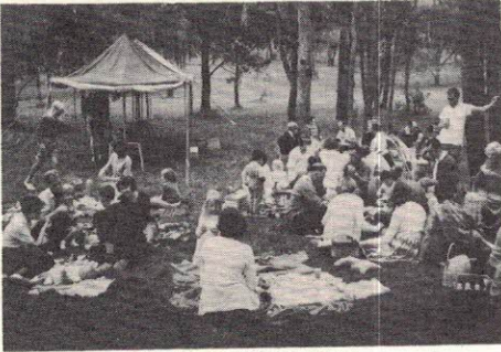
Picnic at Wattle Park