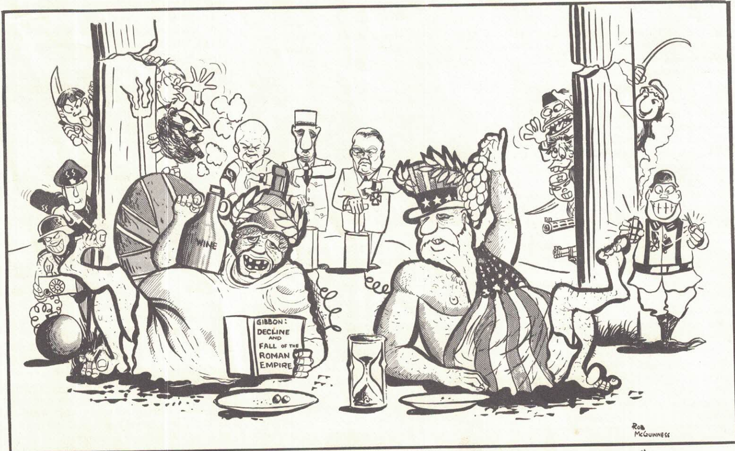
"BRITANNIA OLD BUDDY, ..... SURELY THE CLOUDS COULD'VE SEEN THE SIGNS....."

In a whole lifetime the "busy" bee can produce only 1/10th of a pound of honey.