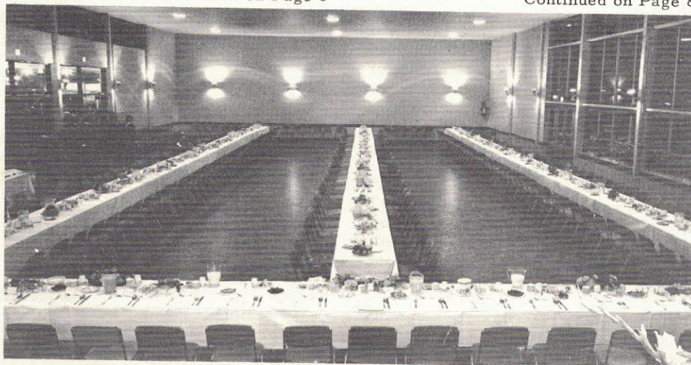
Hall prepared for Feast, Sydney