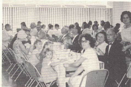
Another scene from Brisbane

Sermons covered Israel's Exodus from Egypt and its application to us today, also the history of God's Holy Days. The brethren were exhorted to search out the leaven yet in their lives,