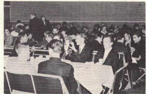
It Really Wasn't TOO Much!

Throughout the Feast the inspiration of Jesus Christ and His obvious blessing on the spiritual and physical food