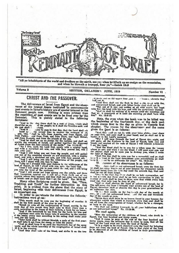
The Remnant of Israel periodical, June 1919

What a coincidence - I received my copy of the Plain Truth today and guess what - N.S.W. Rugby team is playing Eastern Province at the stadium today. N.S.W. [ie the Australian State of New South Wales] are referred to as the "Waratahs"."