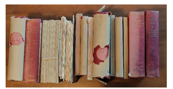
Photographs of the books received

Also, during the evening of 3 January I was looking online for photographs of Rupert and could not find any that I didn't already have. I went to bed (I can still clearly picture the motel room) wondering how to find any.