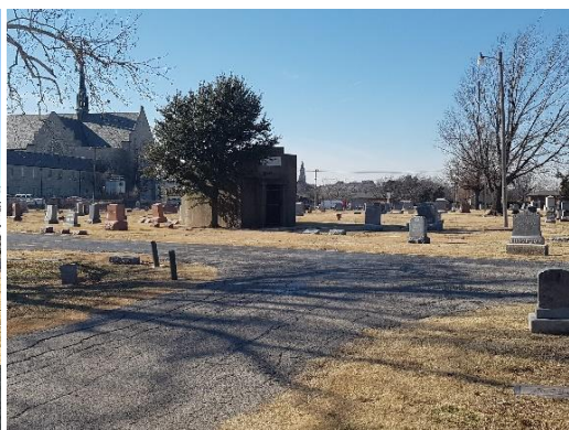
The Rupert family vault where Rupert's coffin is located at Fairlawn Cemetery, Oklahoma City