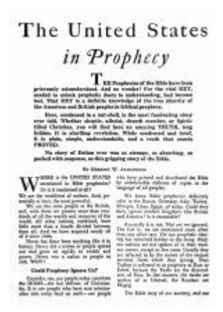
Cover for the 1940 edition

NB: the Ambassador College Bible Correspondence Course , Lesson 16, "Ancient Israel - "Why God's Chosen People"? 1982 was also on this subject. The above are located online at this <u>link</u>.