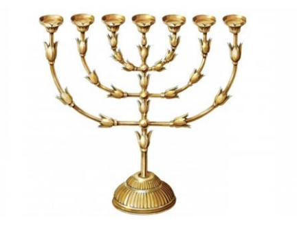
Israel represented by the single lampstand

The lampstand in the Old Testament is a single structure with seven branches – this signifies unity, a clearly identified group, continuum through similar structures.