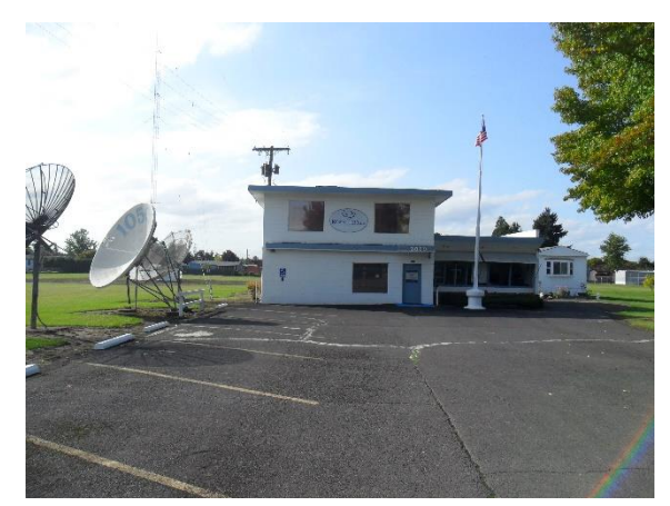
KORE radio station

I slept overnight in Eugene and the next day tried to find these important historical sites - some I found but others I couldn't - I took photographs of those that I did find such as 4th Avenue (where the Armstrong's lived), 8th Avenue (where first church building was located), Amtrak Station (where many broadcasts were recorded), Hult building (site of first home office, now replaced by the Hult), Royal Street (where the Firbutte Hall is supposed to be located but I could not find), the Odd Fellows Building that had a room HWA operated out of at one time and KORE radio station that broadcast HWA's programs.