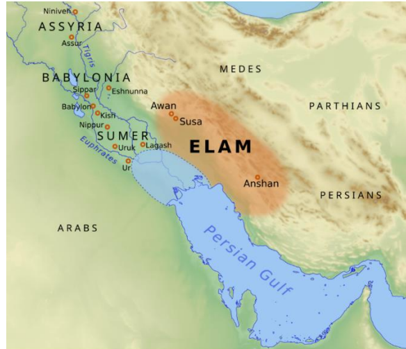
The ancient land of Elam

What did they look like physically? Anthropologists describe them as being neither Nordic nor Semitic (Arabs) (C. Pfeiffer The Biblical World , p. 217). Hinz, author of The Lost World of Elam , writes