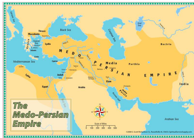
Extent of the Persian Empire

The decisive step came with Cyrus the Great (559-530 BC), founder of the Achaemenid Persian Empire. After overthrowing the Median Empire (c. 550 BC), Cyrus expanded Persian control and around 540-539 BC, he captured Elam and its key city Susa, integrating the region into his growing empire. This occurred shortly before or around the time of his more famous conquest of Babylon in 539 BC. Sources describe this as Cyrus conquering Elam and reuniting Persian-controlled Anshan with the remaining Elamite areas (like Susiana/Susa).