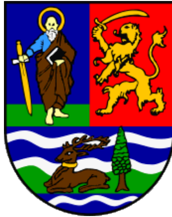
Vojvodina Coat of Arms