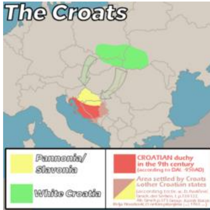
Migration of the Croats

Pliny writing in the first century BC, stated in his Natural History that the Chroasi dwelt with the Massagetae in southern Russia ( Natural History , vi.xviii.xxxxx) and that the Serbi lived on the shores of the Black Sea while Strabo mentions the Chorasmi as also dwelling in southern Russia ( Geography , xi.viii.viii).