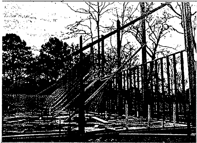
Construction is underway at church property on Lake Palestine