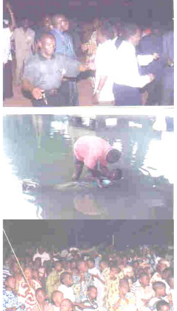
This year we had 15 brethren from Chad Republic, you could remember that I sent you a report of our outreaches in Chad Republic, Chad is a hundred percent Muslim. Praise

Republic this year of 2004. "God's Family Reunion" as it could be called, was celebrated with love, rejoicing, and family caring. Attendees were always being directed, from the pulpit, to rejoice at "God's Holy Party," that this is a Family Affair, to believe that "what makes God happy should make us happy, and that the Feast is only eight days, but memories (made here) last forever." The amount of love, and caring shown to each other this year was just fantastic!!! Not just from those who were the speakers, and volunteers, but from all of the attendees. There was continuous fellowshipping at the planned activities, the outside lunches, and dinners. The activities were blessed by the offer of rides, meals, etc. Everyone seemed to be so attune to others wishes and needs.